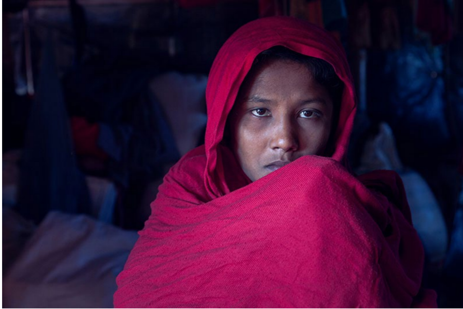
The Rohingyas Stateless, Identityless, Persecuted