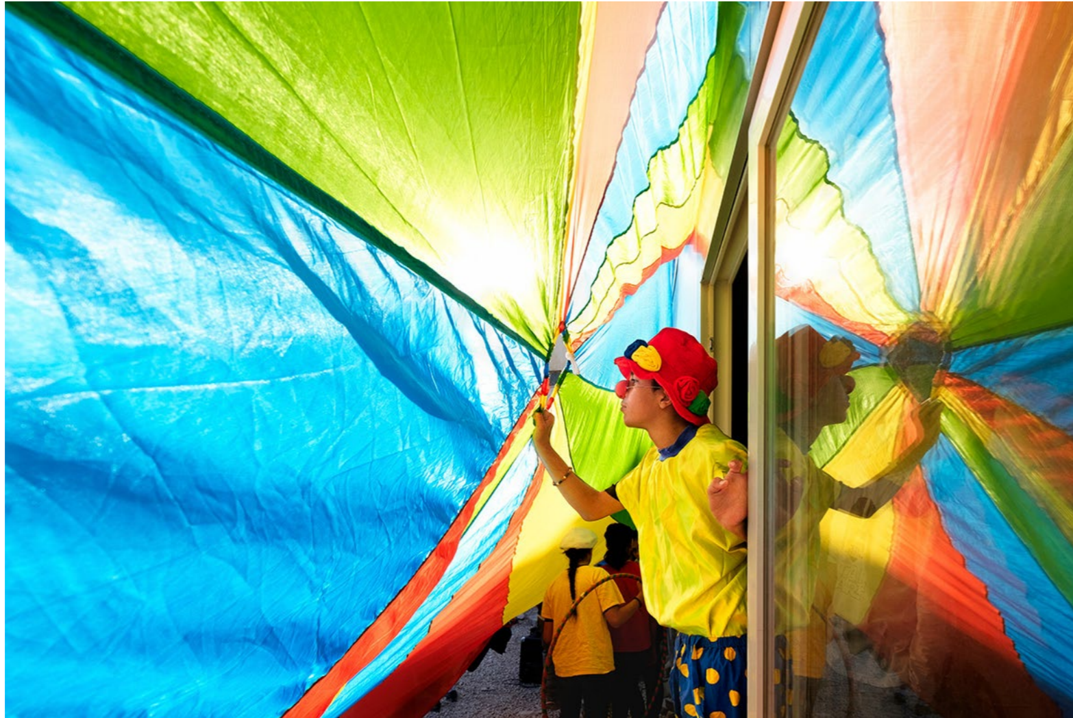
Clowning Fostering Self-Expression Through Arts Project for Syrian refugee children