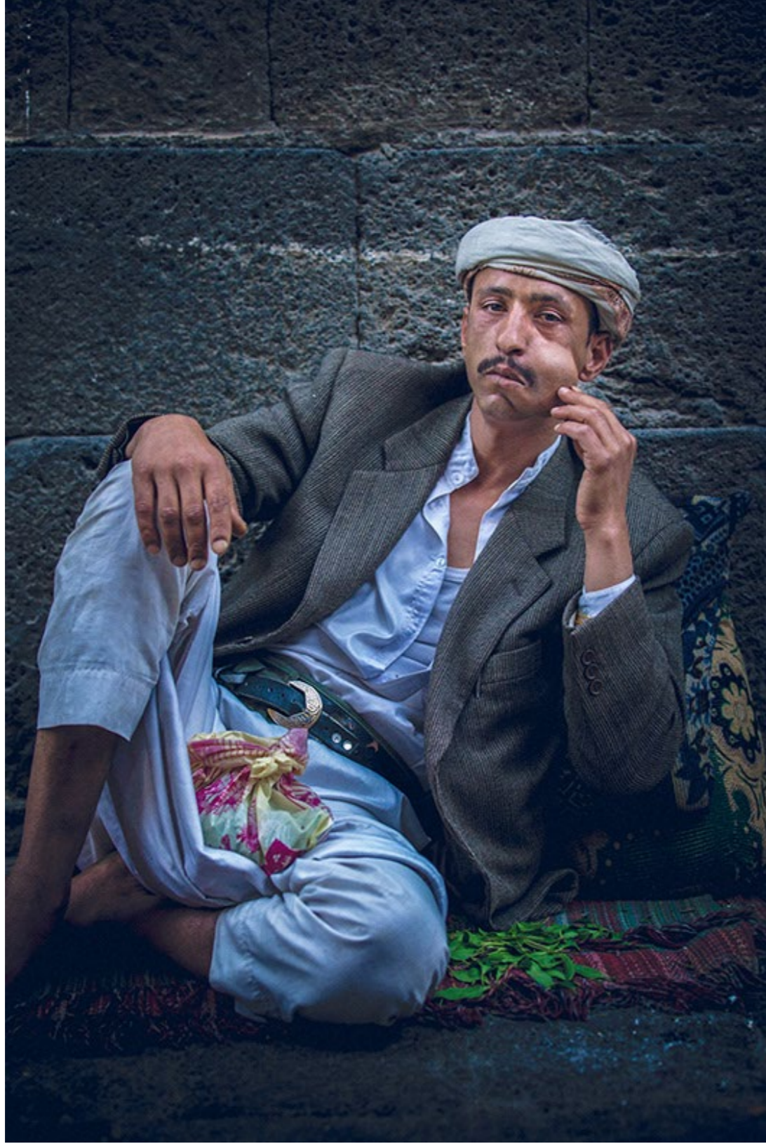
Khat Addiction Yemen