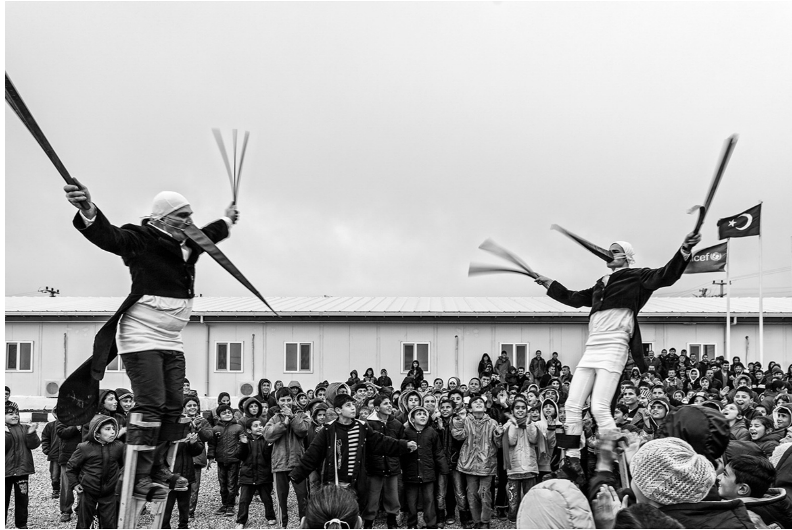
Learning To Walk : Over Gain Cultural Relief Program