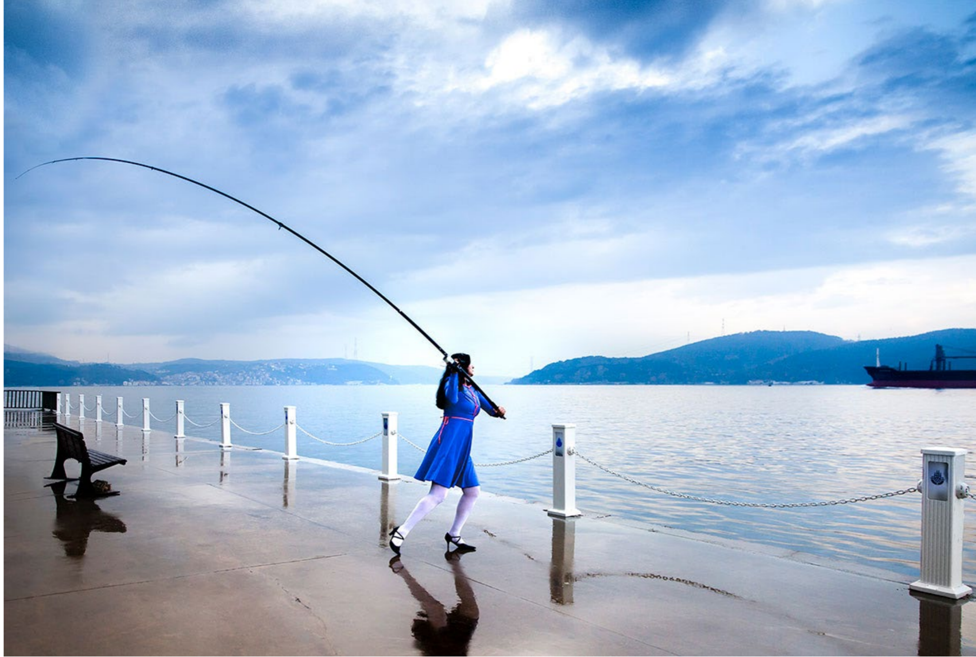
Nezaket-Ekici Performance Artist