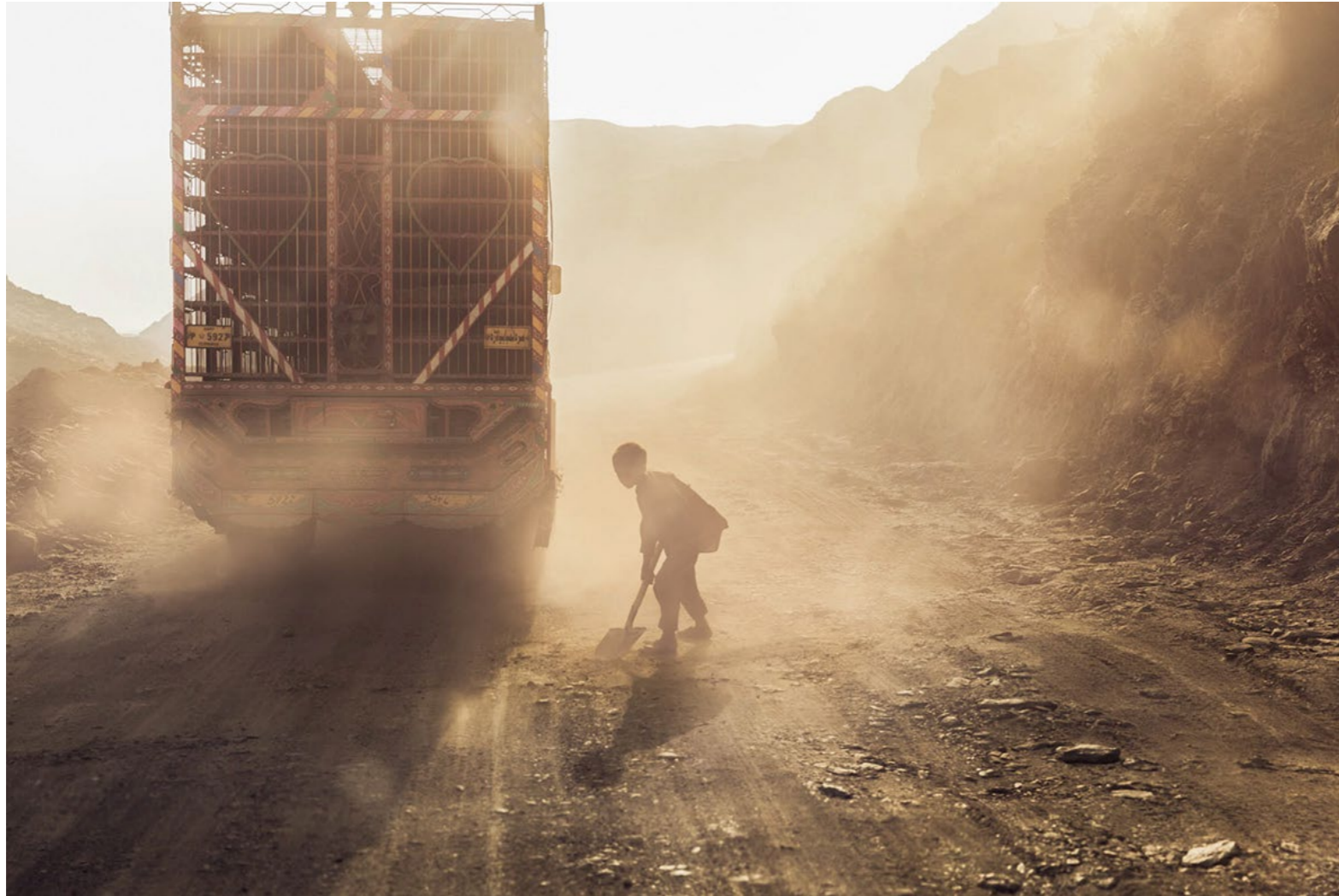
Afghanistan Child Labor