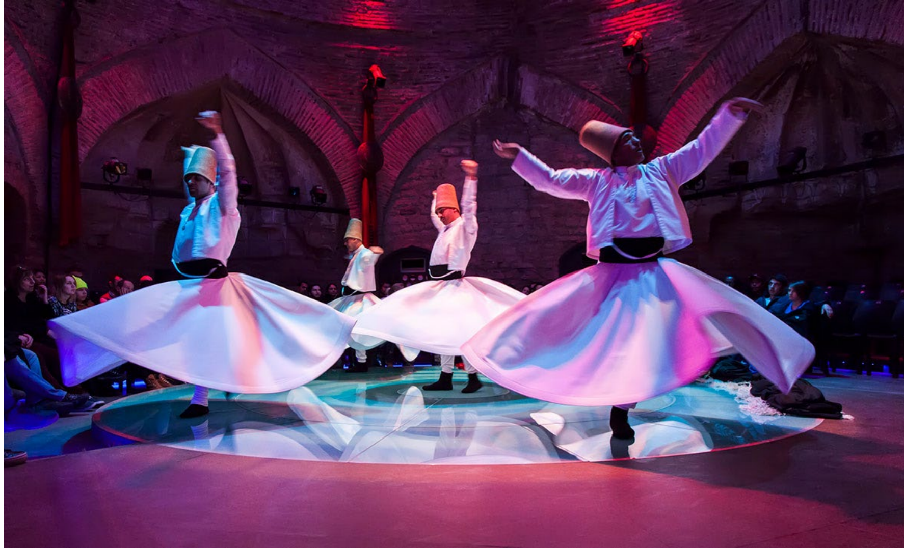
Whirling Dervishes Sufi Ceremony