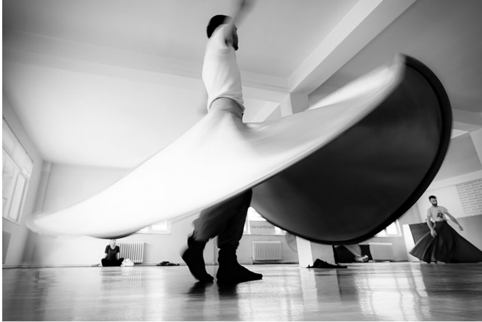
Dervish in Progress Searching Traces Project